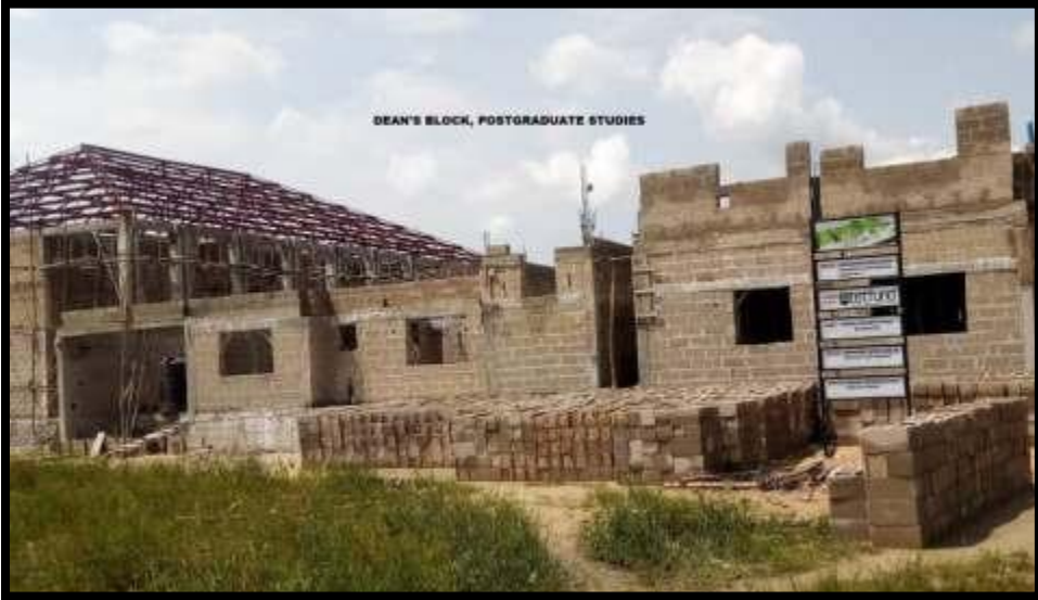
DEAN'S BLOCK, POSTGRADUATE STUDIES