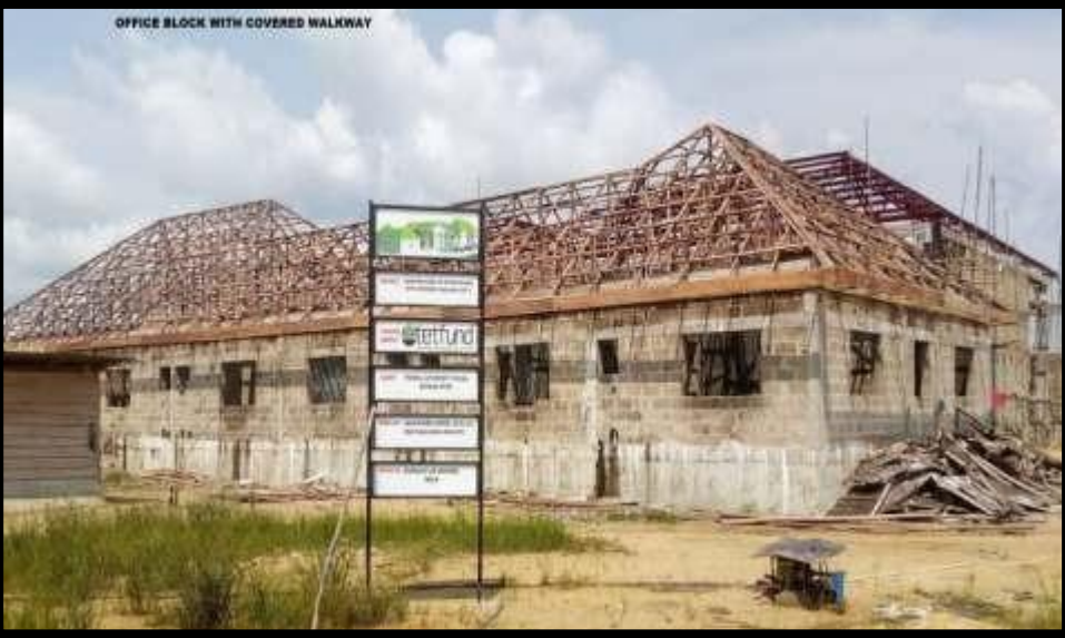
OFFICE BLOCK WITH COVERED WALKWAY